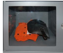
1-Door Model SLM1 Dimensions Inner: 17.9"W x 17.2"H (455mm x 437mm) Opening: 15.48"W x 15.65"H (393.07mm x 397.39mm)