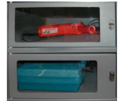
2-Door Horizontal Model SLM2H Dimensions Inner: 17.9"W x 8.5"H (455mm x 218mm) Opening: 15.48"W x 7.01"H (393.07mm x 177.93mm)