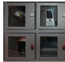
4-Door Model SLM4 Dimensions Inner: 8.8"W x 8.5"H (225mm x 218mm) Opening: 6.42"W x 7.01"H (163.11mm x 177.93mm)