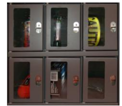
6-Door Model SLM6 Dimensions Inner: 5.8"W x 8.5"H (149mm x 218mm) Opening: 3.44"W x 7.01"H (87.26mm x 177.93mm)

ALSO Available in Vertical 2-Door Configuration!