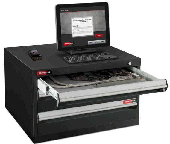
Standalone SupplyPro VIM with SupplyController