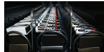
Battery Risers Available